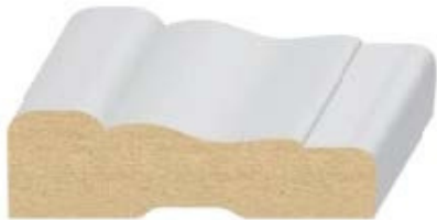
HB356 9/16" x 2-1/4"