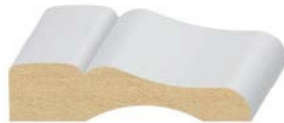
HB711 5/8" x 2-1/2"