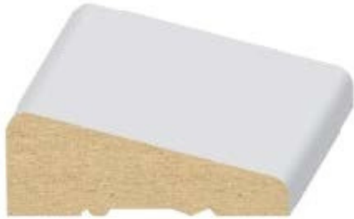
HB916 9/16" x 1-5/8"