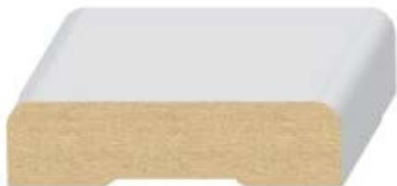
HB120 9/16" x 2-1/4"