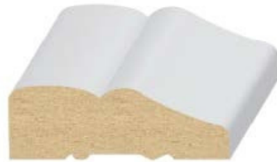
HB711 9/16" x 1-5/8"