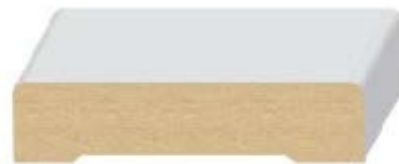
HB120 11/16" x 3-1/4"